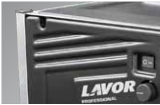
Stacking module structure, it adapts perfectly to any type of installation