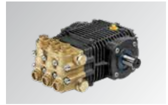
Stainless steel versions for the food sector