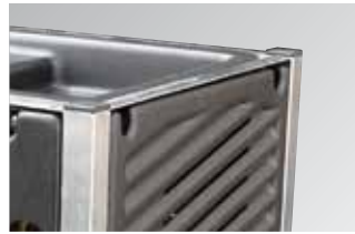
Wall Kits (optional) allows application to the wall for ease of use