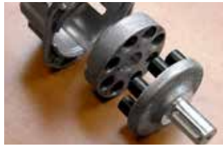
Built-in elastic joint for better pump/motor coupling